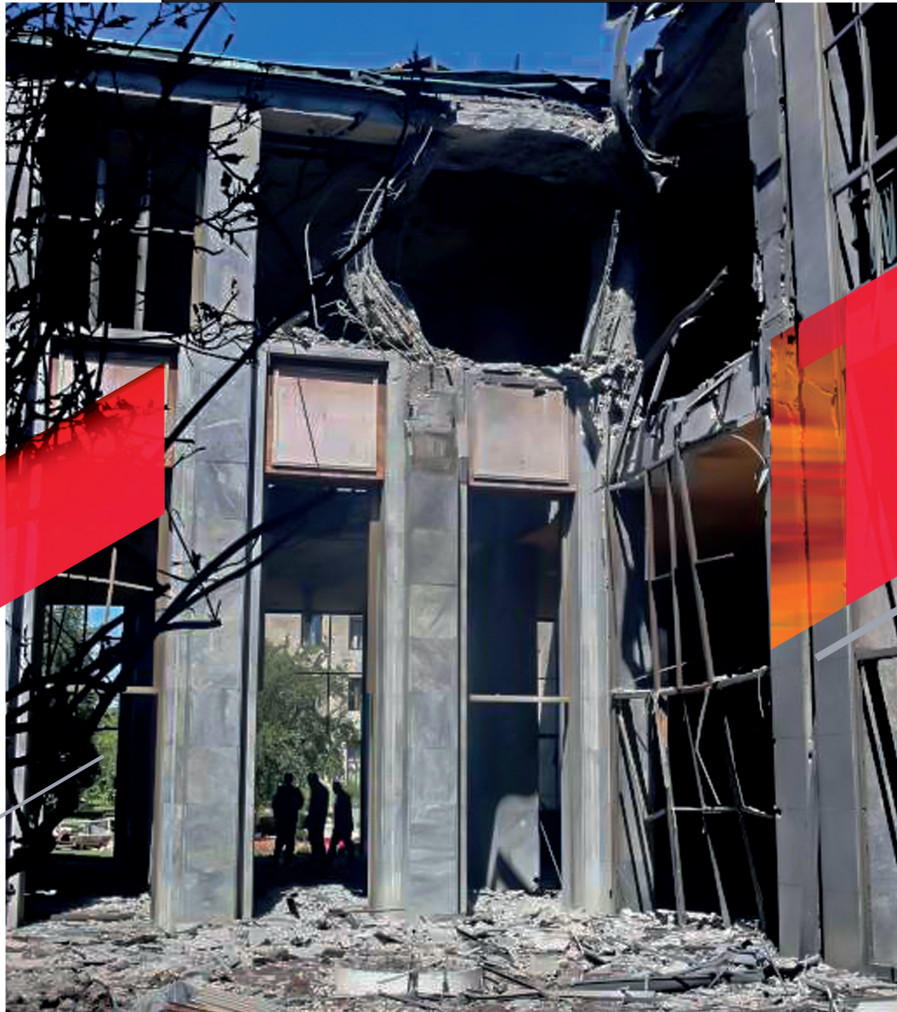
Grand National Assembly Of Turkey 16 July 2016